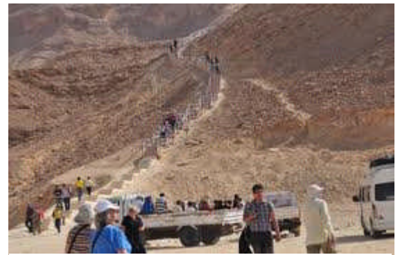
Pathway to St. Anthony's Cave

18. Some brothers were coming from Scetis to see Abba Anthony. When they were getting into a boat to go there, they found an old man who also wanted to go there. The brothers did not know him. They sat in