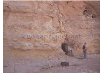
Entrance to St. Anthony’s Cave

In 356AD, two of St. Anthony’s disciples, St. Athanasius of Alexandria and St. Serapion of Thmuis buried St. Anthony at the age of 105 in the desert by his request. The life of St. Anthony the Great was written by this same disciple St. Athanasius. This is the first biography of a saint who was not a martyr.