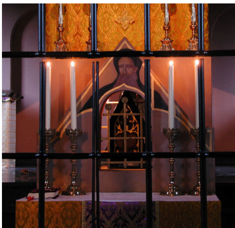
Altar in the chapel at St. Anthony Monastery.

O Father Anthony, you imitated the zealous Elijah. You followed the straight paths of the Baptist and became a desert dweller. By prayer you confirmed the universe. Wherefore, intercede with Christ our God to save our souls.