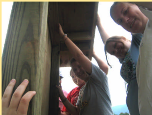
2006 Team Members erect the outdoor prayer shrine, which they designed and constructed.

The High School Student Mission Trip is a ministry of the Ukrainian Orthodox Church of the USA. We hope to bring aid and comfort to those in need through out our country. It is easy to turn a blind eye to those reaching out a hand for help in our local communities. By our actions, we hope to show the face of Christ to these people in need and all we come in contact with and by doing so reaffirm the Holy Orthodox Faith in an Orthodox Service Community. We pray that by offering daily prayer services, as well as our love and works, we will bring not only ourselves but all involved closer to Christ our God.