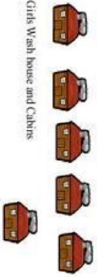
Girls Wash house and Cabins